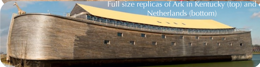
Full size replicas of Ark in Kentucky (top) and Netherlands (bottom)

as a house. You cannot expect to hide it in your back garden. With or without planning permission you'll have to build it in the local park or on the local common. So what's going to happen? People are going to laugh, for a start. There will be vandalism as well. You'll need to mount a guard over night or all your work of the day will be wrecked. The local officials may try to make you stop.